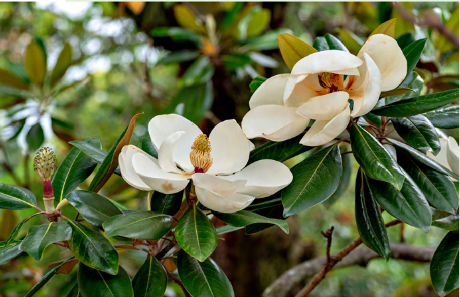
Little Gem Magnolia: Close-up of creamy white Little Gem Magnolia blooms against deep green foliage. Compact, evergreen, and richly fragrant — ideal for small landscapes, foundation accents, or decorative borders.

Evergreens have become a staple in the landscape industry. We offer flowering and border planting varieties in our year-round foliage category.