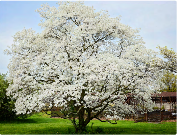
White Dogwood: Classic flowering variety recognized for brilliant white bracts and high landscape appeal. Consistent performance in container production and moderate vigor for manageable shipping size. Strong demand for retail and re-wholesale markets as a native, spring-flowering feature tree. Prefers partial sun and well-drained, acidic soils.