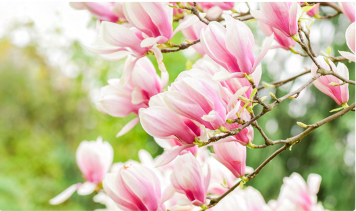
Japanese Magnolia: Deciduous magnolia featuring early-season blooms in shades of pink, purple, or white, depending on cultivar. Excellent container presentation and strong consumer recognition. Performs reliably in Zones 5–9, with moderate growth and a rounded form. Suitable for garden center programs, landscape installations, or accent plantings.