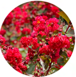
Ruffled Red Magic™