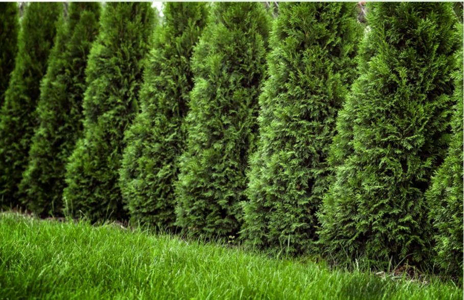
Thuja Green Giant: A row of mature Thuja Green Giants forming a lush, uniform privacy hedge. Fast-growing and evergreen — ideal for border planting, property lines, and naturally hiding neighbors year-round.