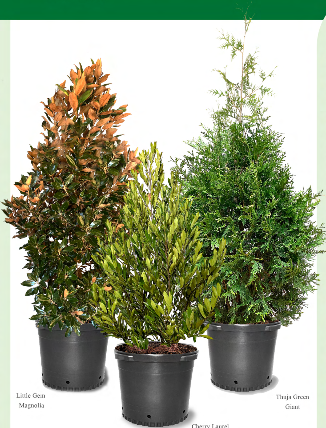
Little Gem Magnolia