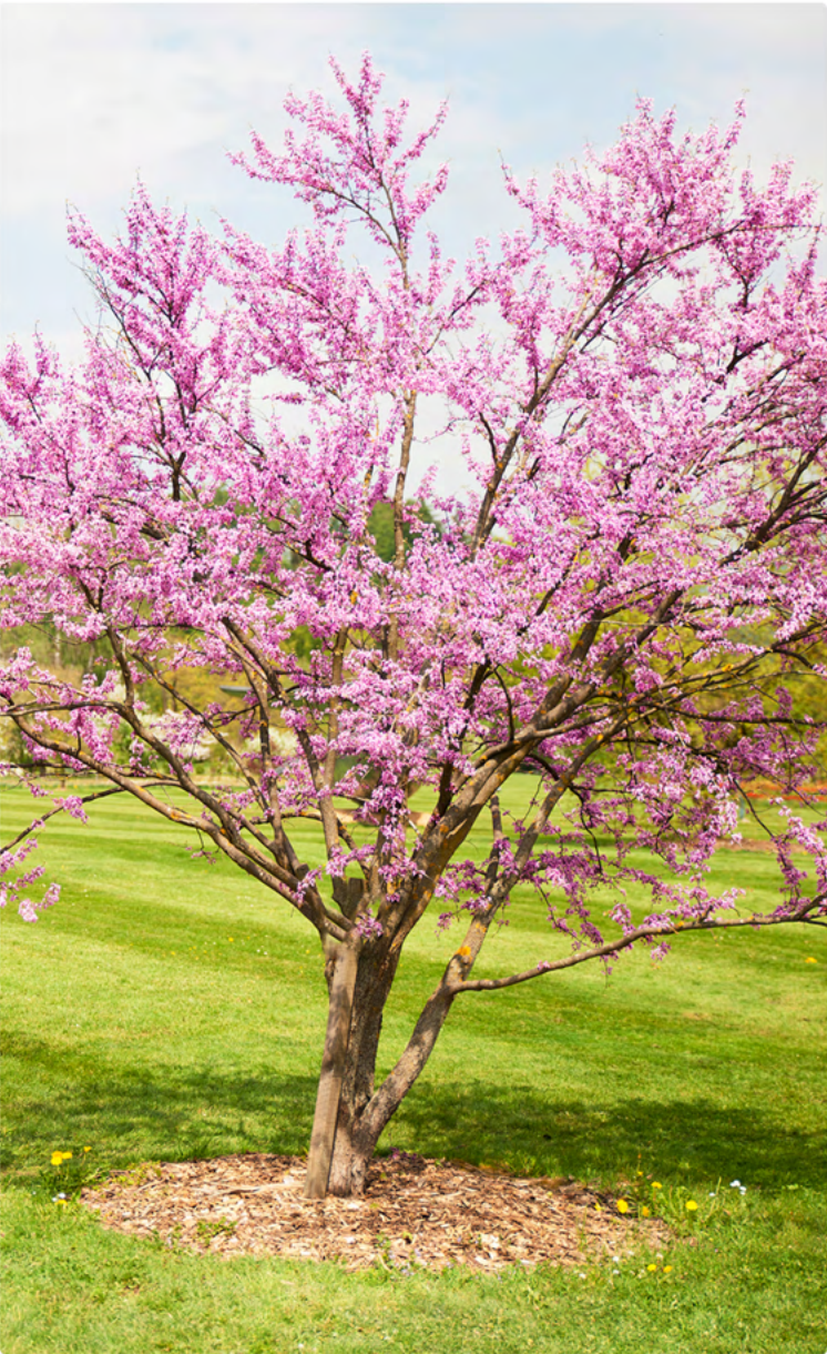
Eastern Redbud: Dependable landscape ornamental known for its early spring bloom and strong form. Produces abundant pink-lavender flowers along bare stems before leaf-out. Performs well in container or field production with uniform branching and moderate growth rate. Adaptable to a range of soils; excellent sell-through as a specimen or small landscape tree.