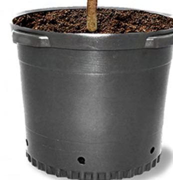
Miami Crape Myrtle

Standard Crape Myrtle: Single-trunk form with a well-defined canopy and vibrant summer blooms. Strong branching, uniform structure, and excellent container presentation.