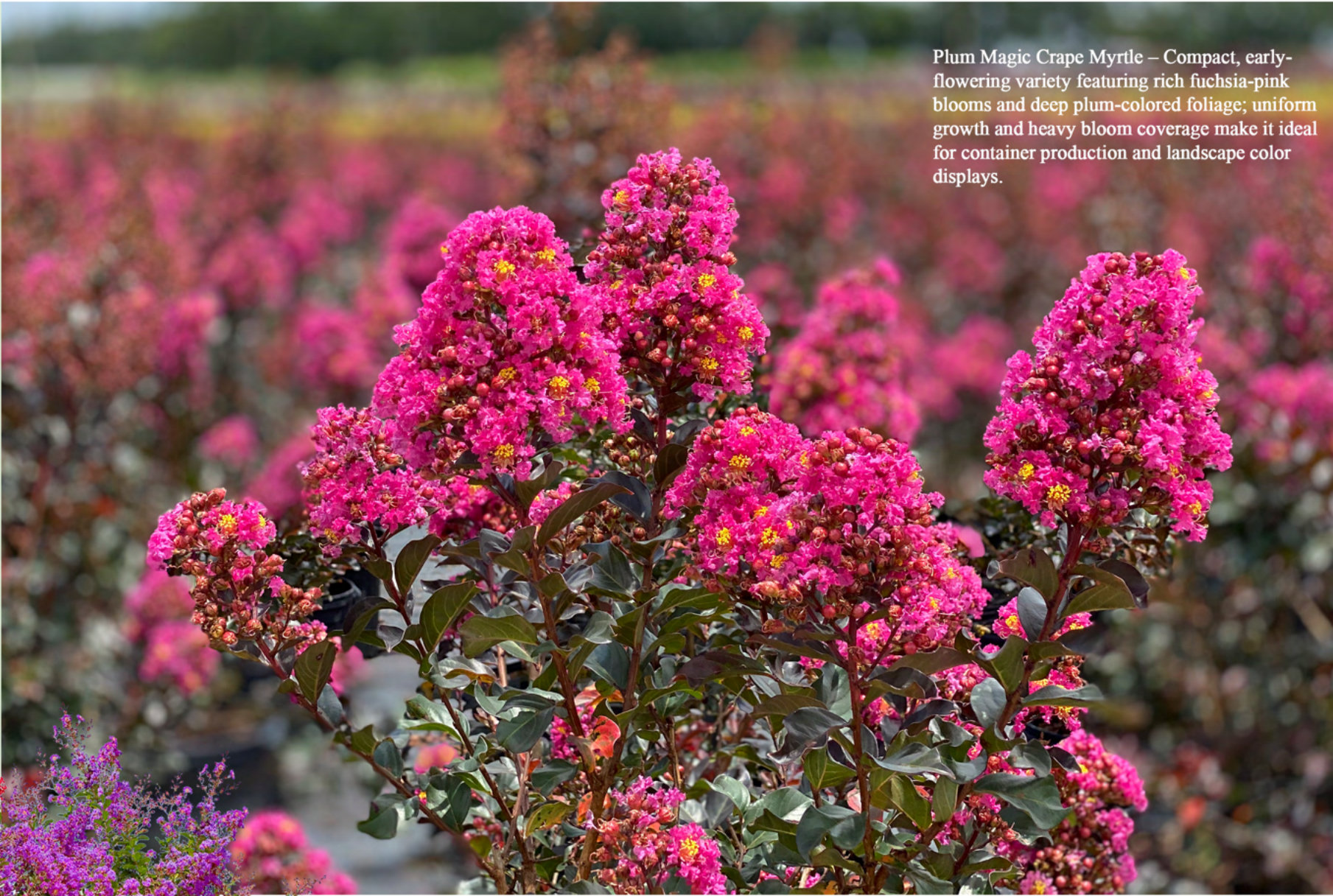
Plum Magic Crape Myrtle – Compact, early-flowering variety featuring rich fuchsia-pink blooms and deep plum-colored foliage; uniform growth and heavy bloom coverage make it ideal for container production and landscape color displays.

Proven landscape performer available in a wide range of sizes, bloom colors, and leaf forms. Strong consumer demand across both traditional green-leaf and dark purple-leaf introductions. Vigorous, drought-tolerant, and highly adaptable to heat and humidity. Suitable for container and field production with excellent branching and long bloom duration. Ideal for retail landscape programs, municipal plantings, and mass color displays. Thrives in full sun and well-drained soils.